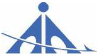
AIRPORTS AUTHORITY OF INDIA