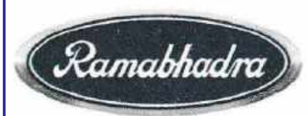
RAMABHADRA INDUSTRIES PVT LTD.