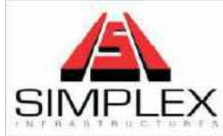
SIMPLEX INFRASTRUCTURES LTD.